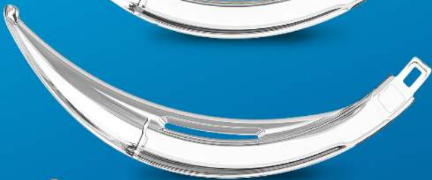
Macintosh Blade size 4