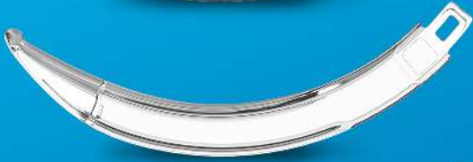
Macintosh Blade size 2