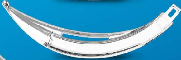
Macintosh Blade size 3