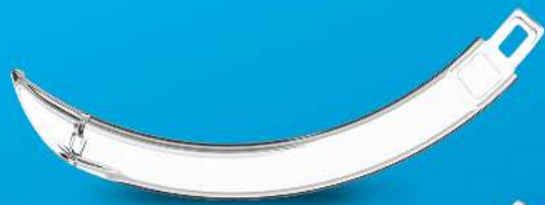
Macintosh Blade size 1