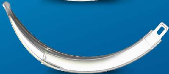
X blade size 3