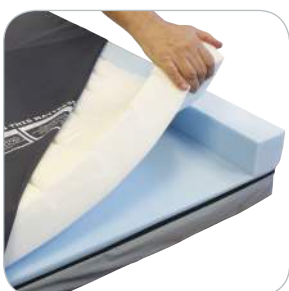
CMHR foam insert

The u-shaped base and side wall construction offer stability and support for patient transfers. The mattress cover has high frequency welded seams and a fully concealed zip which reduces the possibility of fluid ingress thus aiding Infection Control protocols