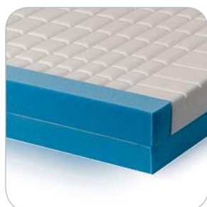
Reinforced CMHR walls