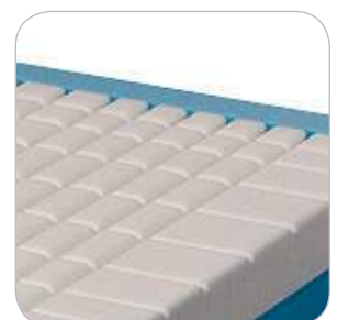
Contoured CMHR foam