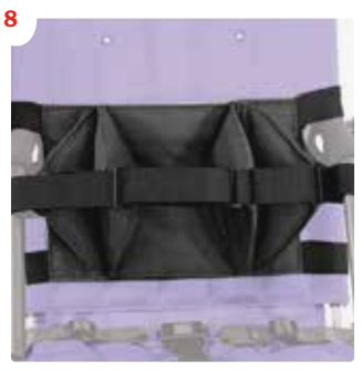
Soft lateral support

Single/Double flap C903328/C903329 CX12 C902859/C902860 CX14 C900678/C900679 C900140/C900204 CX16 C902614/C902615 CX18