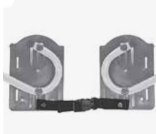
Footplate securement strap C903584