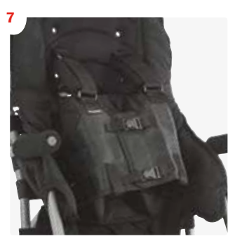
Full support torso vest

CX10 C903330 CX12 C902861 CX14 C900680 CX16 C900339 CX18 C902616