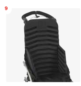
Reducer seat insert

Single/Double flap C903328/C903329 CX12 C902859/C902860 CX14 C900678/C900679 C900140/C900204 CX16 C902614/C902615 CX18