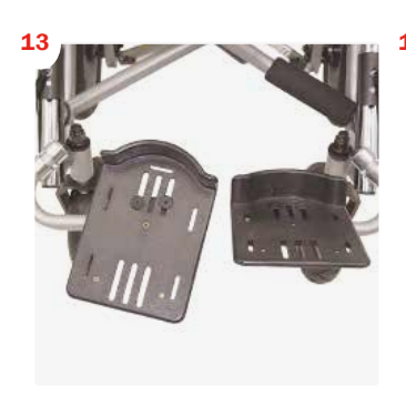
Angle adjustable footplates CX10 C903445 CX12-14 C903268