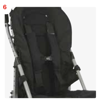
H-harness with padded covers