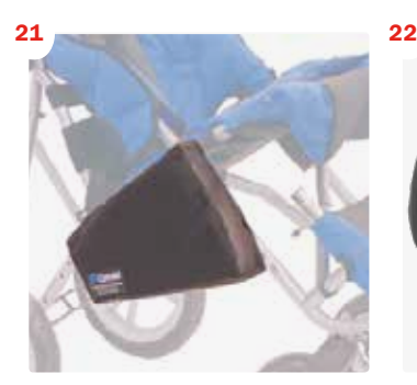
Saddle bag C904094