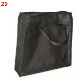
Utility bag C904531

CX10-12 C904520 CX14-16 C904540 CX18 C904048