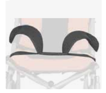
Medial thigh support-abductor

with position/align cushion CX10 C903326 CX12 C902857 C900480 CX14 CX16 C900137 CX18 C902607