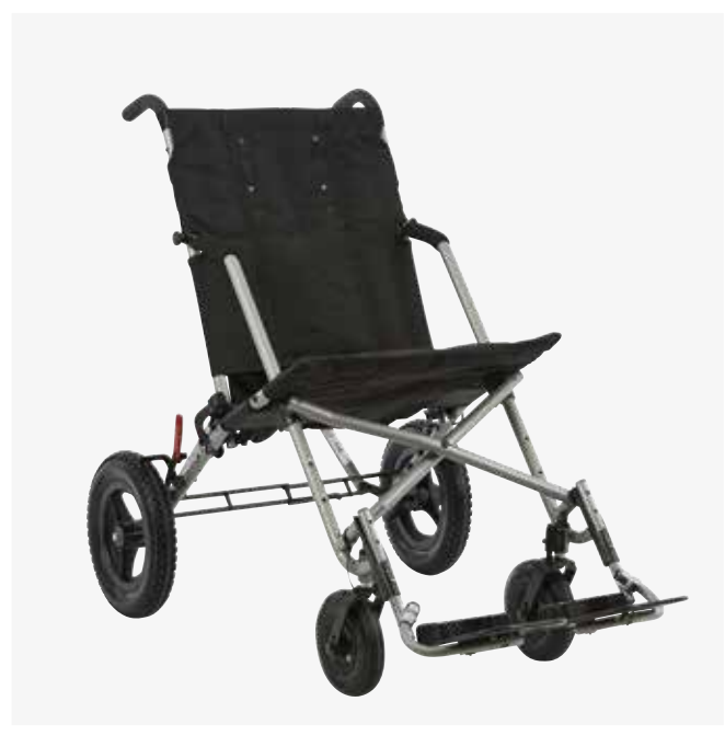
Cruiser standard 18"