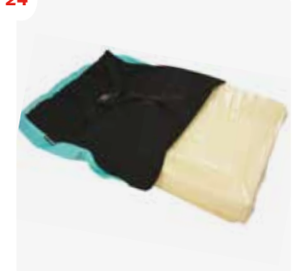
Incontinence cushion liner

CX10-16 C904128 CX18 C903916 C903916 Scout: