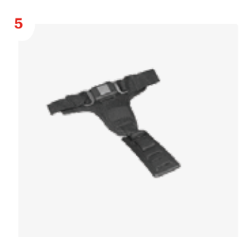
3-pt positioning belt

Padded: CX10 C903331 CX12 C902862 CX14 C900681 CX16 C900142 CX18 C902618 Occi: C904779