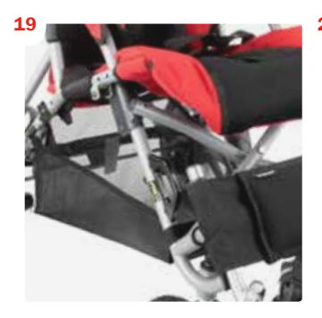
Under seat storage basket

CX10-12 C904520 CX14-16 C904540 CX18 C904048