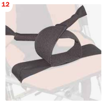
Lateral thigh support-abductor

with position/align cushion CX10 C903326 CX12 C902857 C900480 CX14 CX16 C900137 CX18 C902607