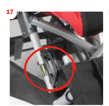
Anchor transit kit

Clear tray CX10 C903078 CX12 C903385 CX14 C903386 CX16 C903387 C903388 CX18