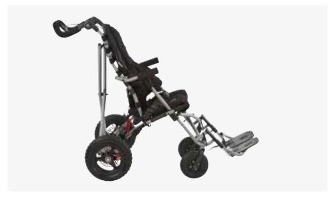
Increased tilt angle improves postural control through upper body positioning.