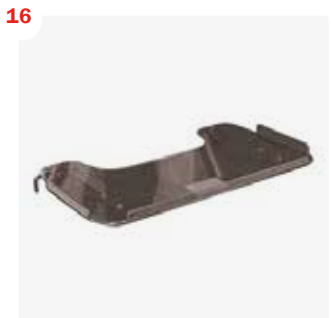
Upper extremity support surface

Small (18-25 cm) C903415 Medium (20-28 cm) C903416 Large (23-30 cm) C903417