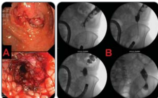
◀ A. SEMS placement for occlusion due to colorectal cancer of the descending colon B. Improvement of the patient's symptoms after stent placement

[The Scientific World Journal, Vol. 2013, Article ID 651765, 4p]