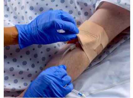
The stretch material allows the clinician to view the site.

The flexible protective overlay maximizes IV patency while protecting the site from patient tampering. IV-ARMOR reduces the introduction of infection associated with IV reinsertion.