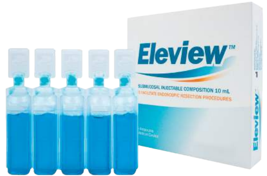
5 ampoules / pouch (10 ml / ampoule)

Elevview™ is a new submucosal injectable composition intended for use in gastrointestinal endoscopic procedures for submucosal lift of polyps, adenomas, early stage cancers, or other gastrointestinal mucosal lesions, prior to excision with a snare or endoscopic device.