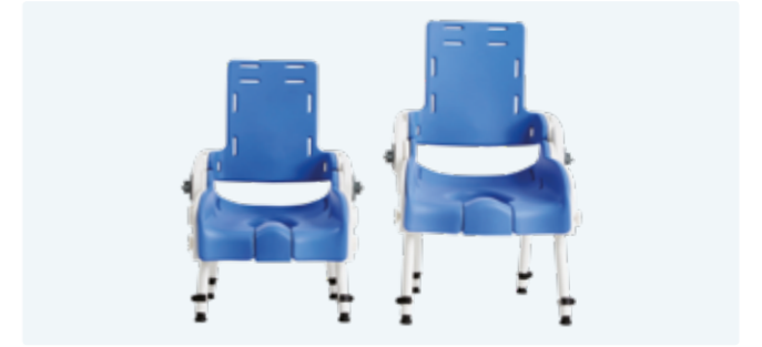
Size 1 frame fits the size 1 Flamingo seat Size 2 frame fits the size 2 Flamingo seat Flamingo seats available with grey or blue PUR inlay