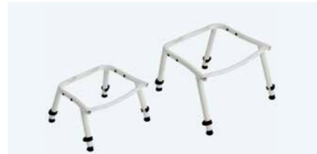
Low, height adjustable frame in two different sizes