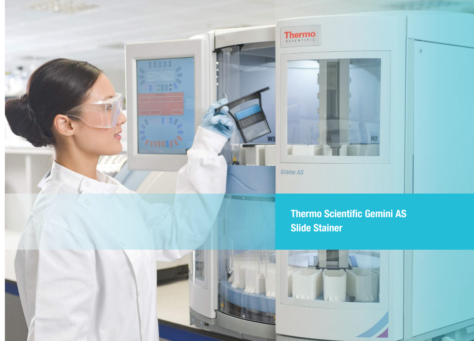
Thermo Scientific Gemini AS Slide Stainer