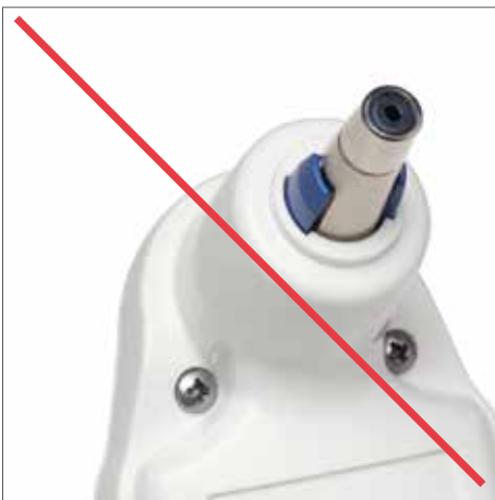
A lens damaged with ammonia