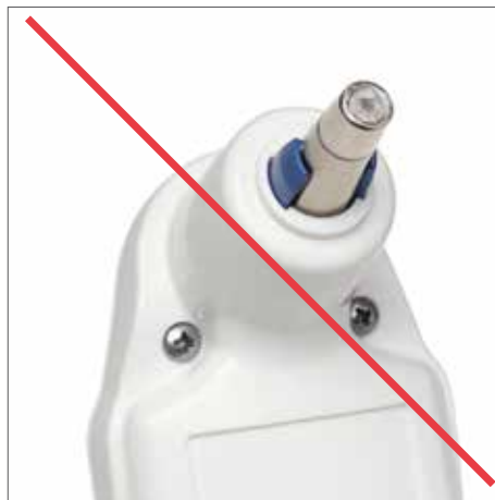
A lens dirty with earwax