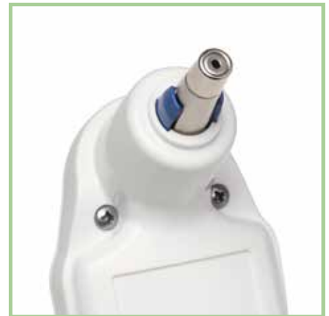
The clean lens