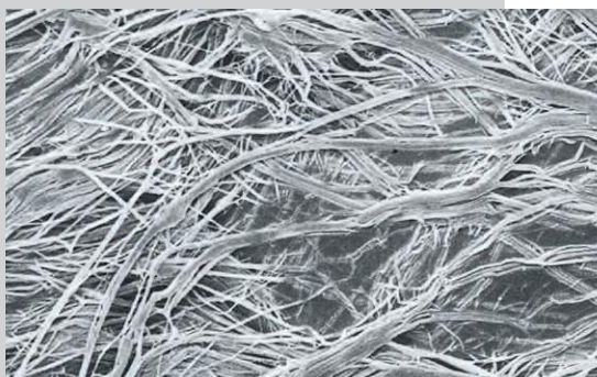
SEM of Previous ePTFE Reinforcing Film Photomicrograph 1000x Magnification 10 Microns