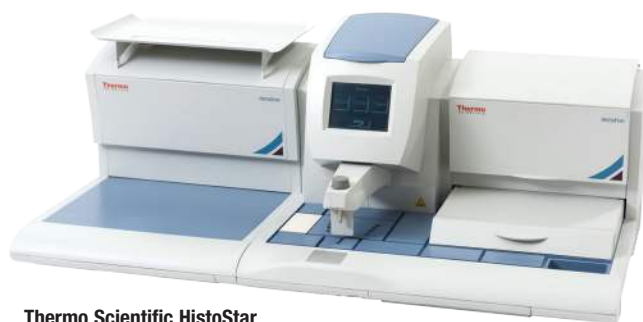
Thermo Scientific HistoStar Embedding Workstation