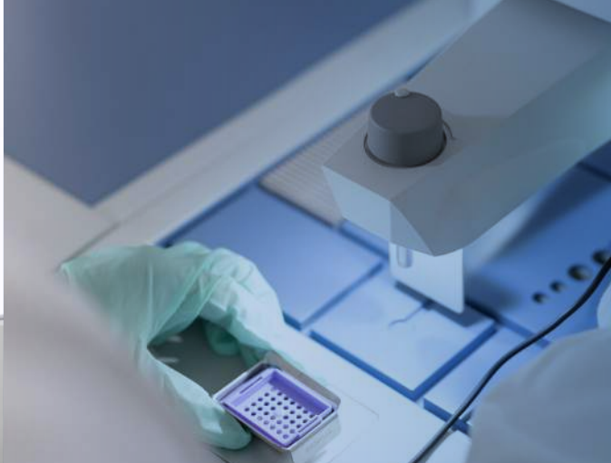
Thermo Scientific HistoStar Embedding Workstation