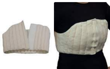
Double Mastectomy Pad