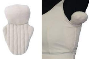
Mini Axilla Pad