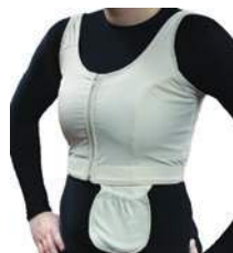
Drain Pocket Pad

JOBST JoViPads are available in both Black and Buff variants and a number of sizes ranging from small to extra large.