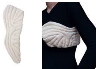
Serratus Anterior Pad