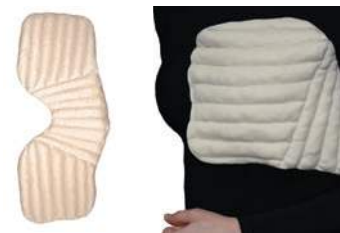
Unilateral Post-Mastectomy Pad