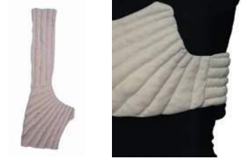
Chest-Wall Pocket Pad