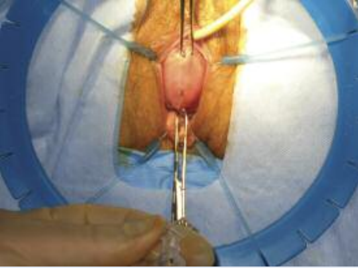
The Lone Star Retractor System facilitates mid-line incision of the anterior vaginal wall during cystocele repair.