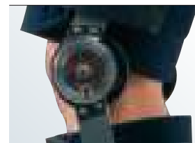
new, patented “QuickSet” hinge