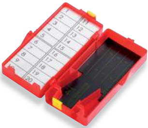
22. 31181459 Single foam block with magnet