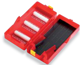
24. 31313425 Single foam strips with single magnet