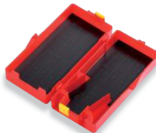
23. 31181467 Double magnet