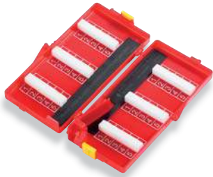
17. 31142451 Double foam strips with blade remover