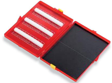
19. 31142188 Large foam strips with single black magnet