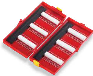
20. 31142303 Double foam strip