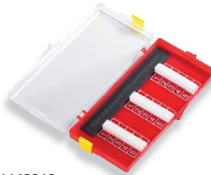
21. 31142212 Single foam strips with clear top