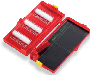
18. 31142295 Single foam strips with magnet and blade remover