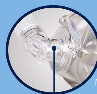
Mask not flexed

The flexible swivel elbow of the AirLife NIV mask reduces the torque applied to the seal between the mask and patient, helping to minimise pressure points.