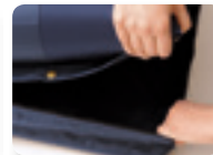
optional insert of mattress base