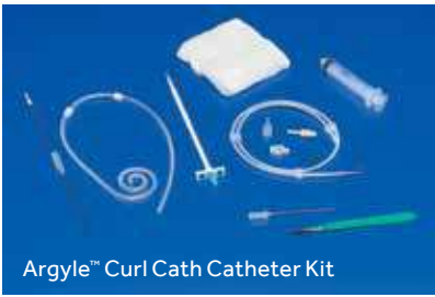
Argyle™ Curl Cath Catheter Kit