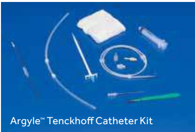
Argyle™ Tenckhoff Catheter Kit