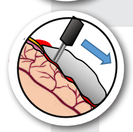
Step 3: Continue to apply PuraStat by moving the endoscopic applicator until the product exceeds the margins of the lesion. Practical experience suggests to work from distal to proximal (Prof. Bhandari).

PuraStat is also indicated for the reduction of delayed bleeding following gastrointestinal endoscopic submucosal dissection (ESD) procedures in the colon.