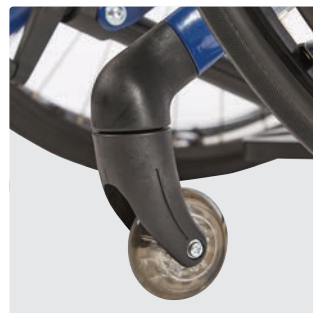
Without brakes (driving wheels must be fitted)