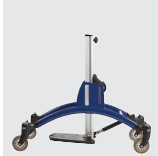
Size 2: Blue