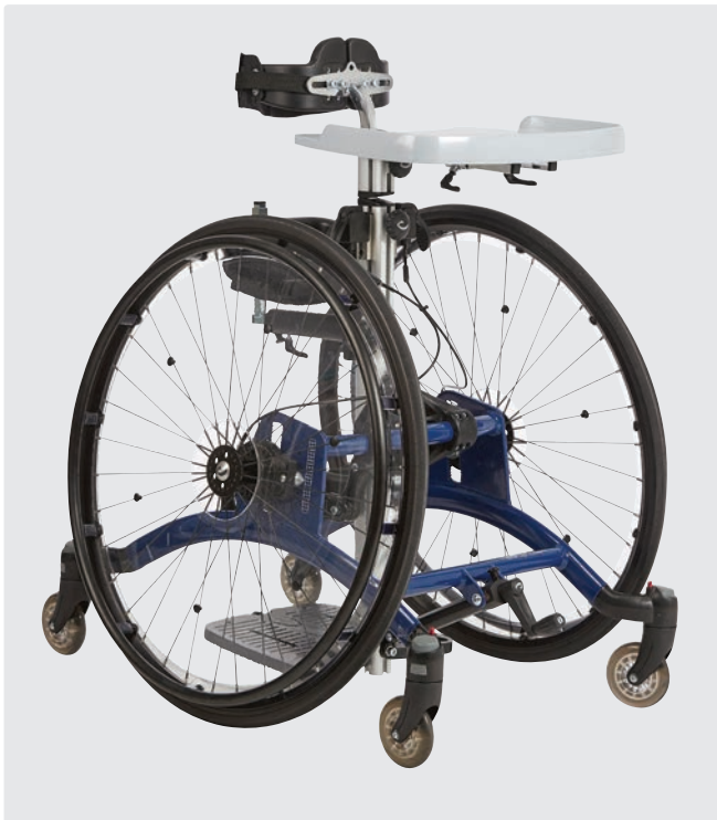
2 driving wheels 4 castors with or without brakes.