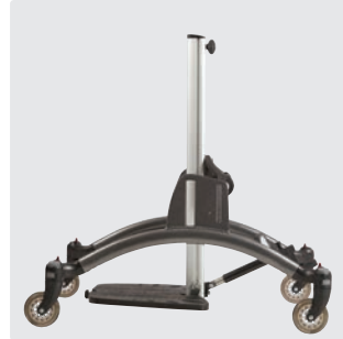
Size 3: Anthracite grey