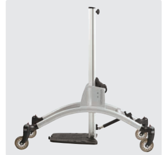
Size 4: Silver