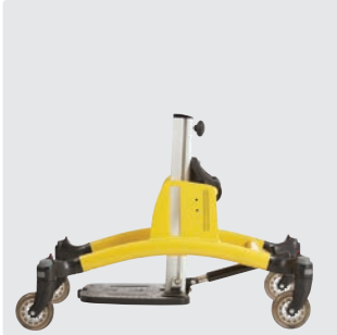
Size 1: Yellow