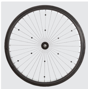
Available in 22", 24", 26", 29", 32", 36"