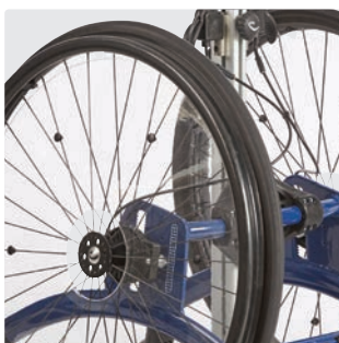
Closed push rims