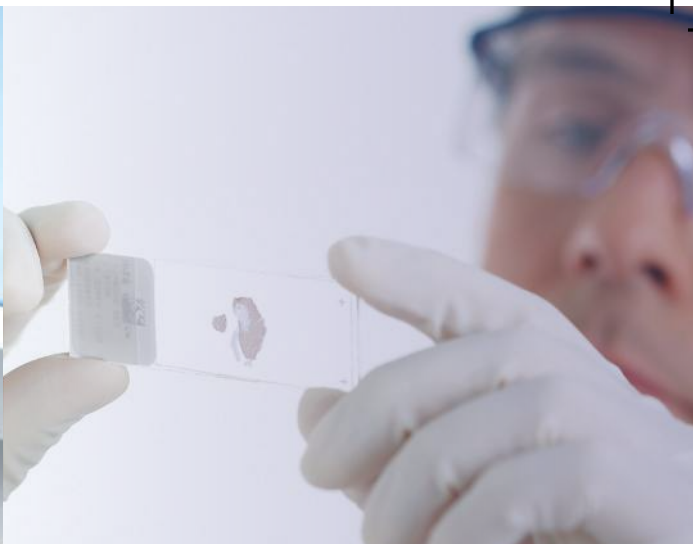
Thermo Scientific ClearVue Thermo Scientific CTM 6 Automated Coverslippers