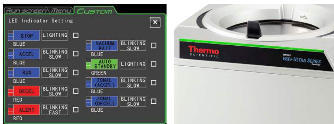
Personalize Stat Light color and intensity for visual indication of instrument status.