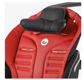
Anatomic head rest 8720862, 8720863