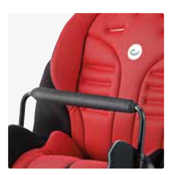
Grip handle 872040x