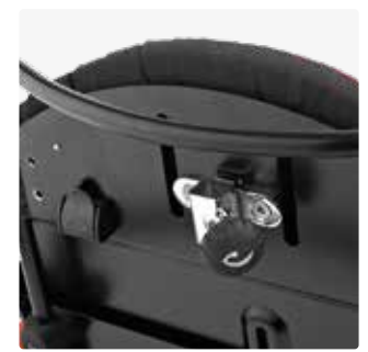
Head rest fitting 8720850