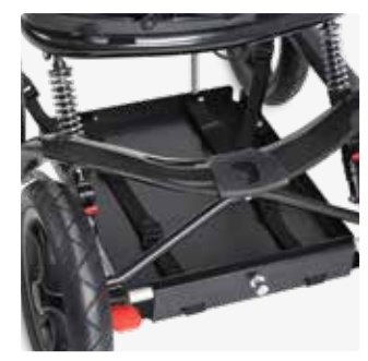
Vent tray 8776290