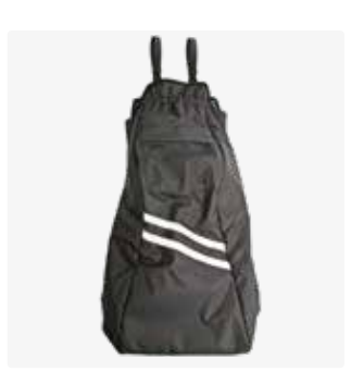
Thermo bag 87460-xxx