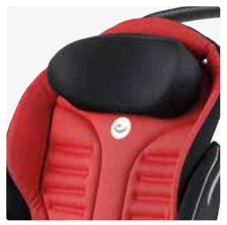
Head rest cushion 8740810, 8740820