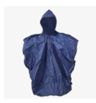
Rain cape with hood 87465-xxx