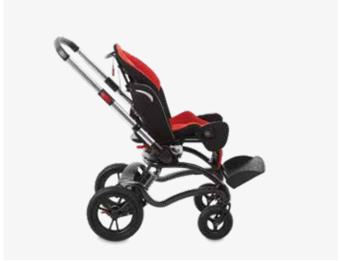
Standard Stingray with 7" turnable front wheels, with directional stabilizer