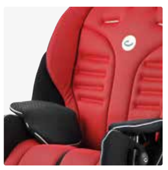
Hip supports 87402x0