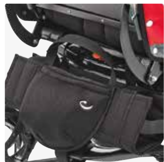
Oxygen bottle holder 8776295