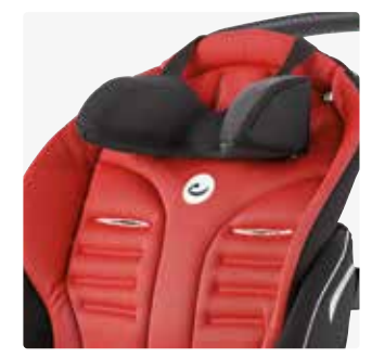
Sculpted head support