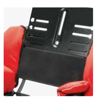
Foam back plate 877632x