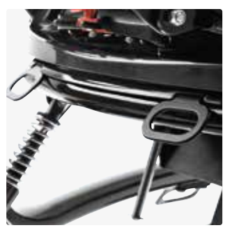
Transport fittings 8720902