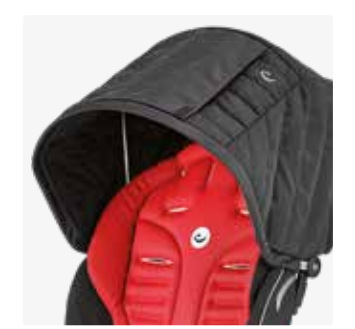
Folding top 8740110, 8740120