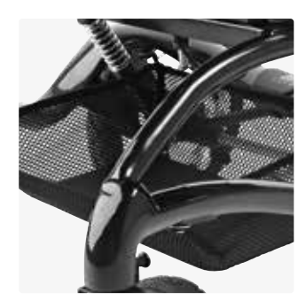
Shopping basket 8720600