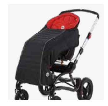
Bunting bag 874013x