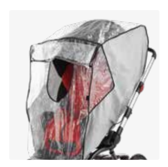
Rain cover 872014x