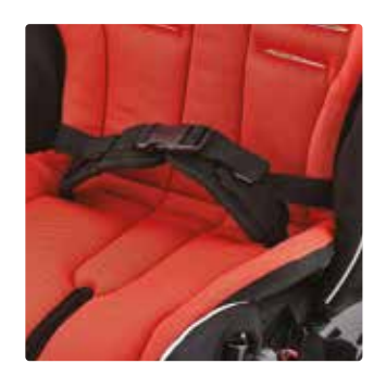
Hip belt 85427-x