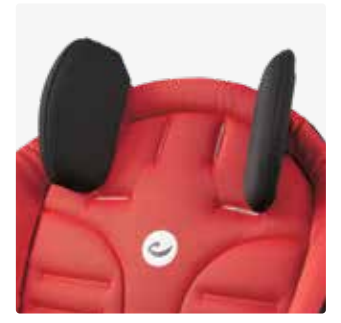
Two-part head support 8720870