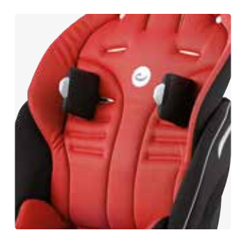
Side supports 872030x