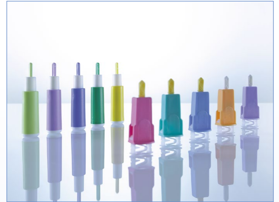
Lancets are colour-coded for easy identification of puncture depth and application.

The safety mechanism ensures that the blade/needle is automatically retracted after the puncture and is safely enclosed within the plastic housing. In particular when dealing with our youngest patients it is imperative that the procedure be as gentle as possible to avoid causing unnecessary anxiety. The safety mechanism means that the blade/needle is hidden from view, allowing the blood collection to take place in a more relaxed atmosphere for all concerned.