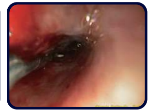
TTS Esophageal stent passing through the narrow stricture