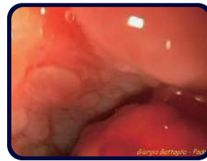
Tight and Narrow stricture